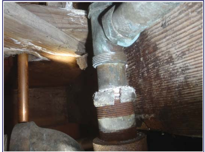
Broken slip-nut to the drain line below the hall bathtub