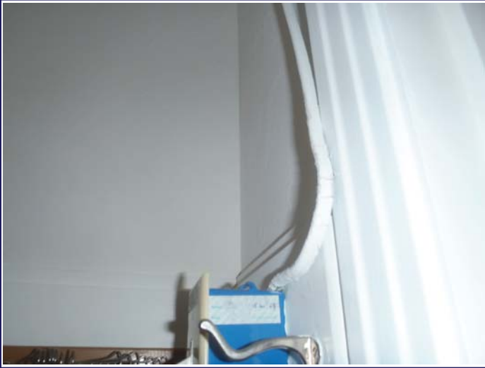
Unprotected electrical wiring in the rear bedroom closet