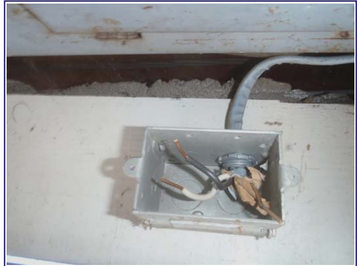
Exposed electrical wiring inside the wooden cabinet for the main panel