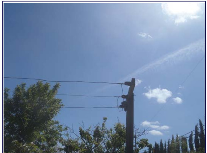
Overhead wiring in the rear yard is to low