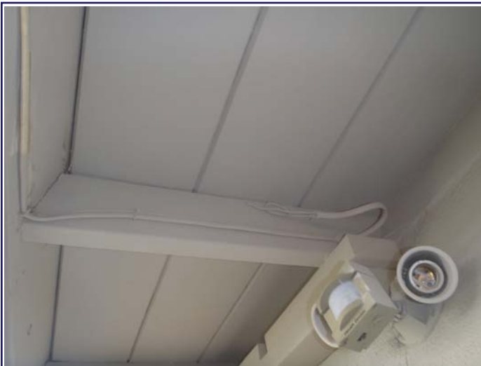
Unprotected electrical wiring below the roof eaves below the front rear of the house