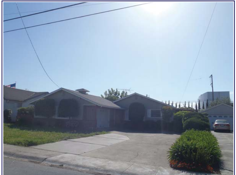
271 Serena Way