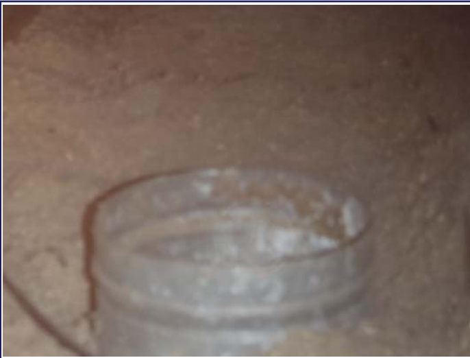
Missing exhaust duct above the kitchen area