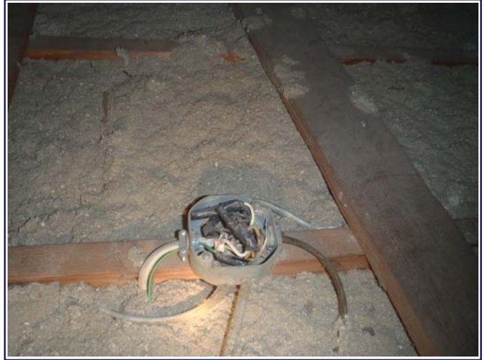
Uncovered junction boxes in the attic at several locations