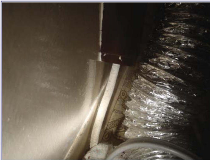
Unprotected electrical wiring in the laundry area