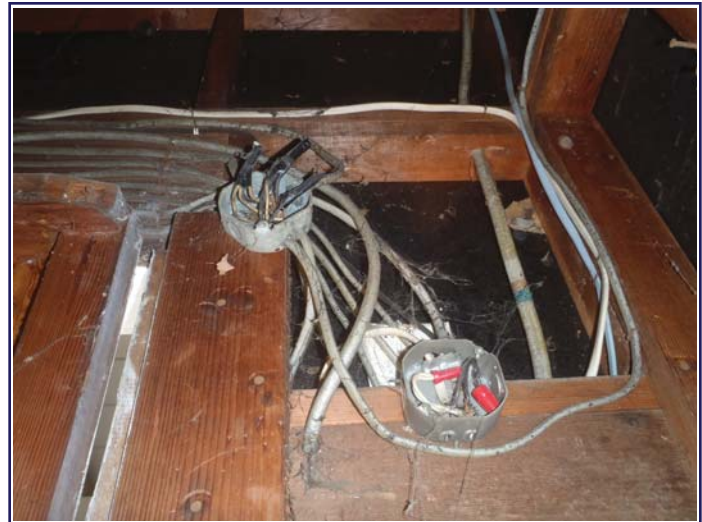
Uncovered junction boxes in the garage, adjacent to the door